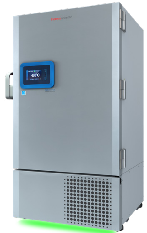
Figure 1. TSX Universal Series ULT freezer. Available in four sizes, the smallest unit, the TSX40086, shown here, can hold up to 400 boxes in a 8.21 sq. ft. footprint, while the largest unit, the TSX70086 freezer, can hold up to 700 boxes in an 14.26 sq. ft. footprint.

The TSX Universal Series ULT freezers (Figure 1) feature our next-generation Universal V-drive adaptive control technology, designed to minimize energy consumption without sacrificing sample security. While conventional ULT freezers use single-speed compressors that continually cycle on and off, the V-drive runs the compressors at variable speeds, adjusting cooling performance to the cooling demands inside and outside the freezer. When conditions are stable, the V-drive controls the system at low speed, which helps reduce energy consumption while maintaining a stable temperature for sample protection. When there are frequent door openings or samples being added to the freezer, the system detects the activity and increases the drive speed (Figure 2).