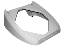
SmartView™ Platform p/n 00-079-009-001